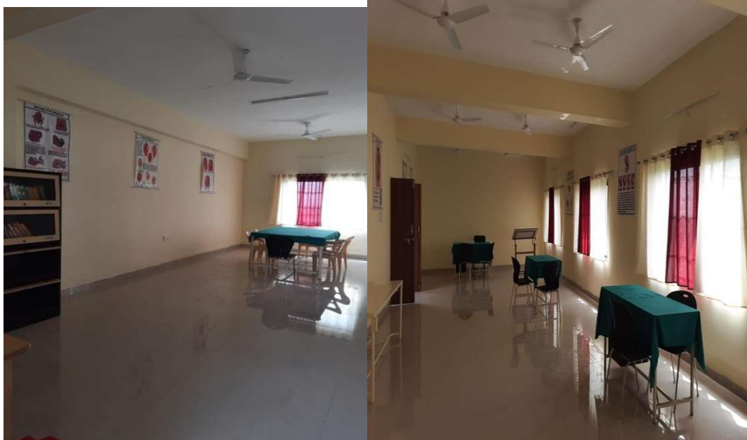
Departmental Library Departmental Tutorial Room